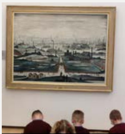
Lowry Trip (Year 2)