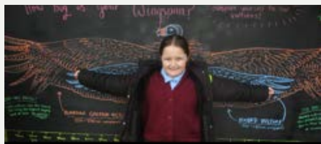
Birds of Prey (Year 4)