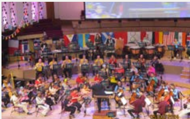
Liverpool Philharmonic Hall (Year 4)